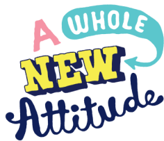
Disabled Persons Assembly NZ