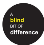
Blind Citizens NZ